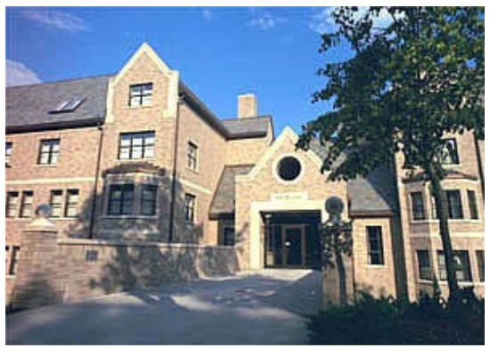
Gabelli Hall (2016 Summer Institute Housing)

On-campus housing is recommended for your convenience. Housing is available in a furnished dormitory on the Chestnut Hill campus, in double-occupancy rooms in suites with shared bathrooms. The fee for housing is not included in the program fee. The fee for housing for the 20 nights of the program (Sunday night July 16 through Saturday morning August 5) is $1100.