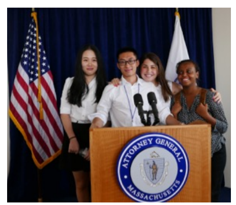
Summer Institute Participants from China, Chile, and Ethiopia

The program is limited to 30 participants. We recommend that you submit your application no later than March 1, 2017 .