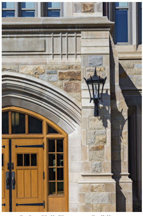
Stokes Hall Classroom Building

The program fee is $2950, which includes