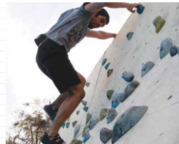
Sports at UANDES