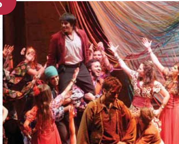
Musical: El Zorro at UANDES

Universidad de los Andes offers international students the possibility of learning or improving their Spanish skills in a cultural and academic environment. Our immersion program provides the necessary tools to interact with and comprehend the Latin-American Culture with a practical approach.