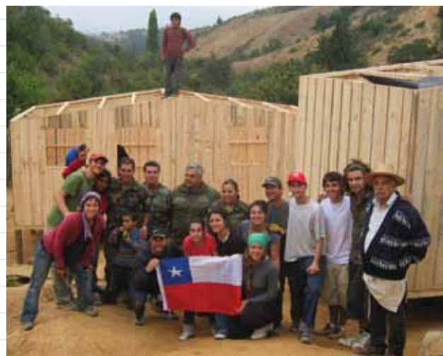
Volunteering in Pichilemu