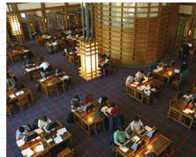
Library Reading Room