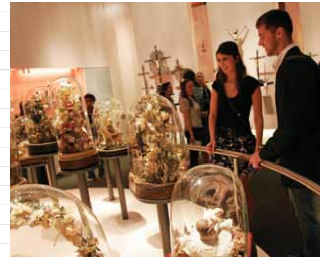
UANDES Art Museum

Buddy Program> Each international student will be assigned a "buddy" who will orientate and help in the integration process.