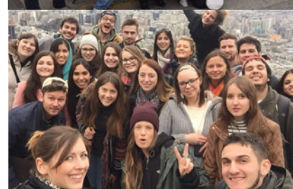
San Cristóbal Hill