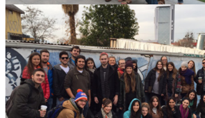
Pablo Neruda's house Museum "La Chascona"