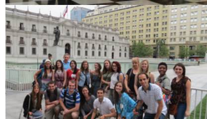
La Moneda Presidential Palace