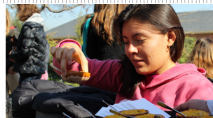
Chilean Lunch at UANDES