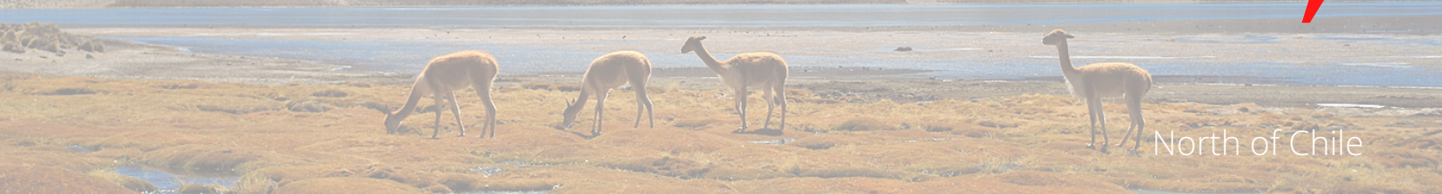
North of Chile